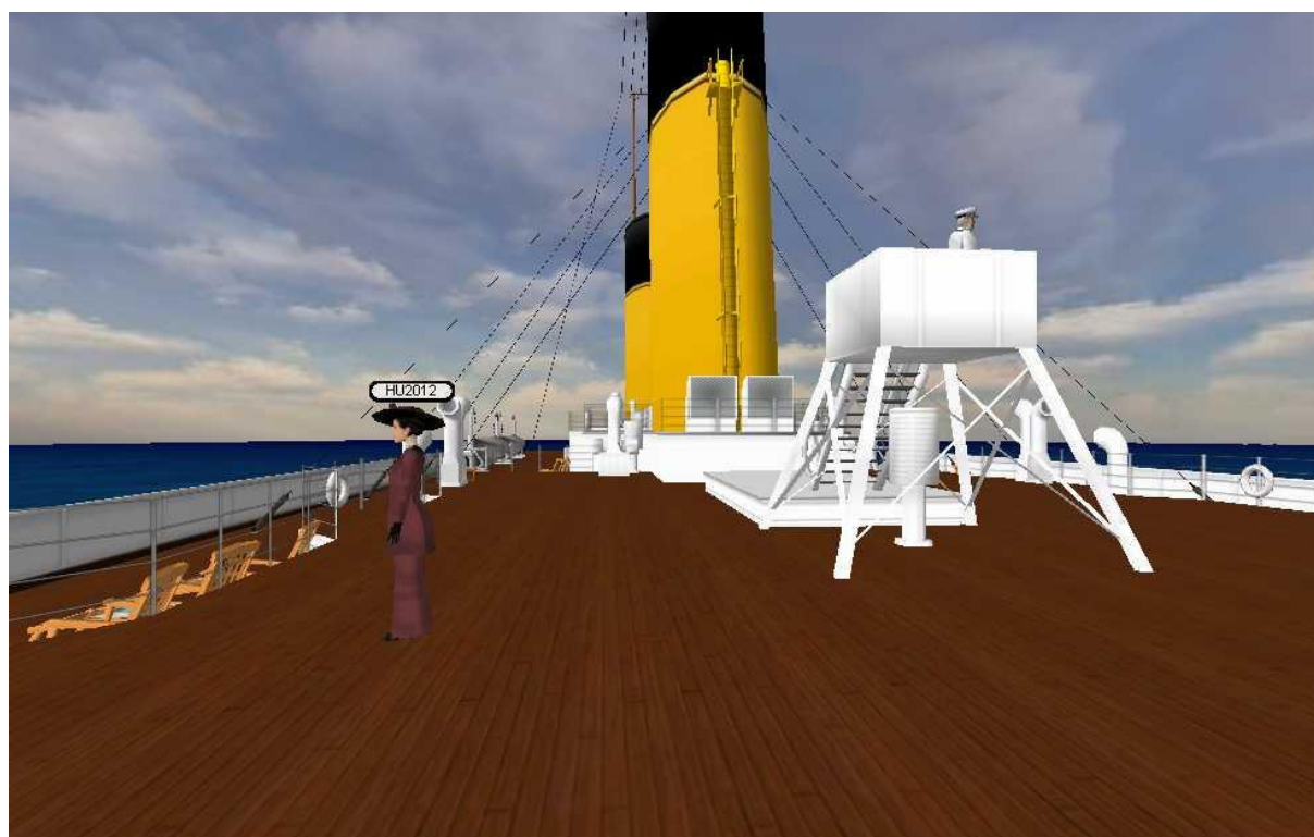
Figure 1. 3D Titanic SIM with additional objects for the Panique à bord'-Quest.

Another recent development is the integration of the use of 3D virtual environments. Howard Vickers coined the term SurReal Quest for this specific genre and elaborates on its design approach in this Volume. His earlier publication (Vickers, 2007) inspired the cross-media, interactive narrative WQ 'Panique à Bord, one the pilots in the ViTAAL project, using 3D virtual worlds for language learning. The Panique à bord'-Quest, set on board of the virtual version of the Titanic in Active Worlds , presents a detective-like problem solving task involving integrated training of language skills and triggering oral, synchronous interviews with the avatars of the story characters (Visser & Koenraad, 2009).